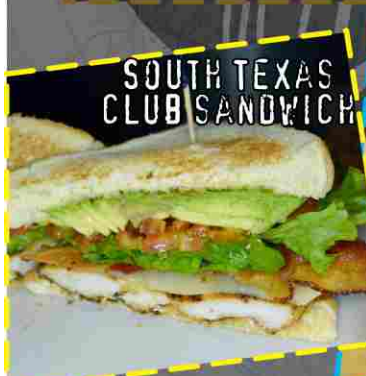
SOUTH TEXAS CLUB SANDWICH

Jalapenos, Mushrooms, BBQ Sauce, Sauteed Onions, American Cheese, Monterrey Jack Cheese, Cheddar Cheese or Swiss Cheese .75 cents Each