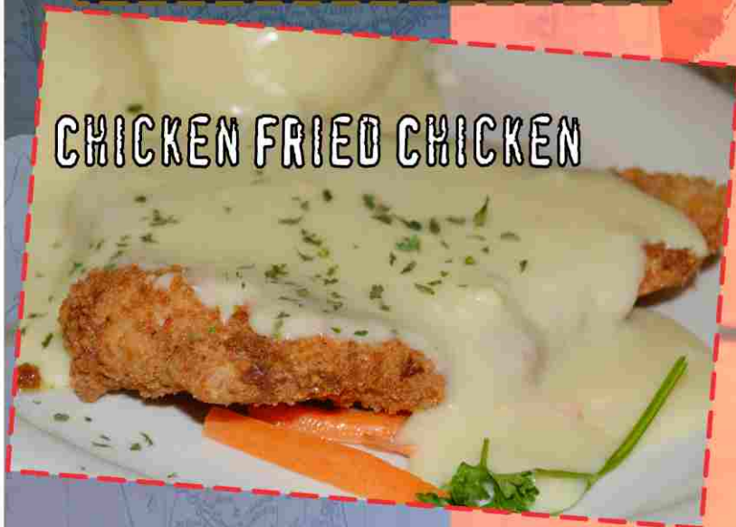
CHICKEN FRIED CHICKEN

(Above comes with Soup or Salad, Choice of potato or vegetable of the day. Except for the Lunch Salad, Lunch Pasta & Lunch Sandwich of the day.)