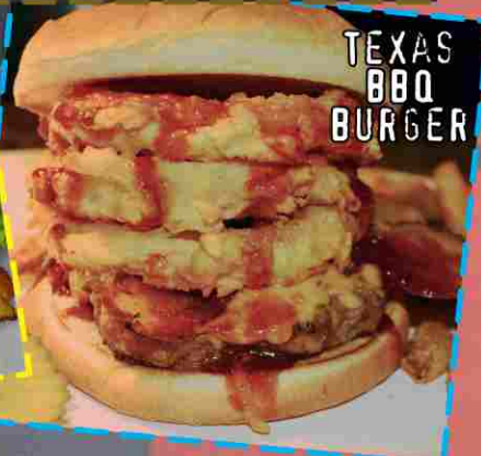
TEXAS BBQ BURGER