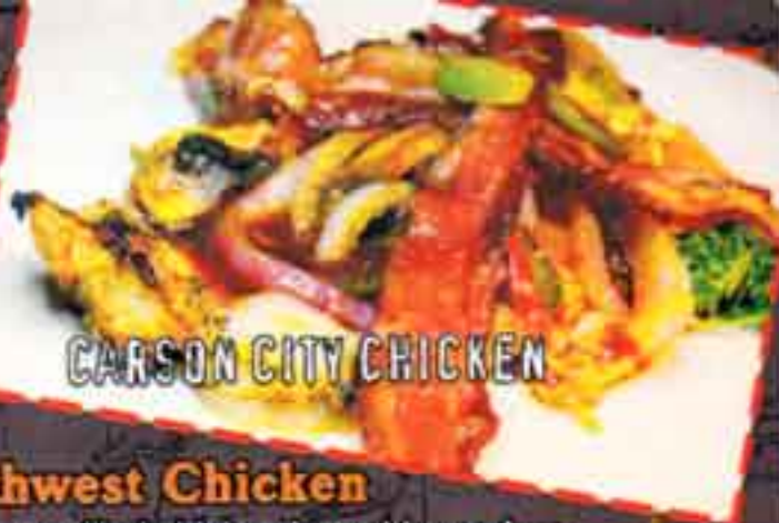
CARSON CITY CHICKEN

**ALL FISH PRODUCTS MAY CONTAIN BONES Eating raw or undercooked shellfish or meat may be hazardous to your health! Please ask your doctor before consuming raw or undercooked food!