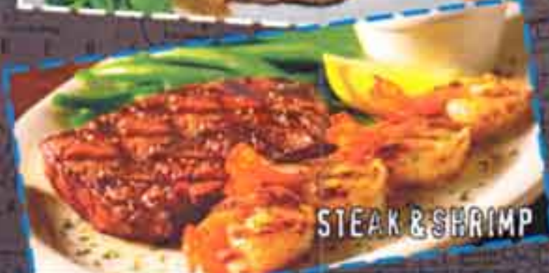
STEAK & SHRIMP