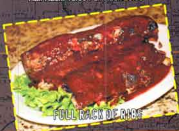
FULL RACK OF RIBS

This meat will peel right off the bone! Half Rack: 13.99 Full Rack 23.99