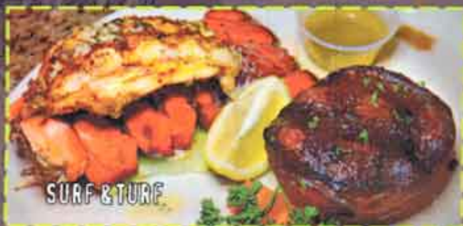
SURF & TURF

Two oven broiled 6 oz. Lobster Tails fresh from the sea, served with Garlic Butter Sauce. 36.99