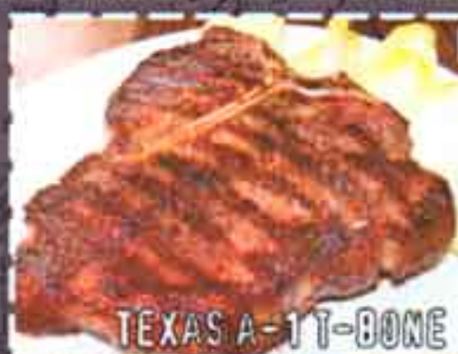
TEXAS A-1 T-BONE

A Texas treasure to be sure! 12 oz. 17.99 (for medium well-well, cooking time 20-25 minutes)