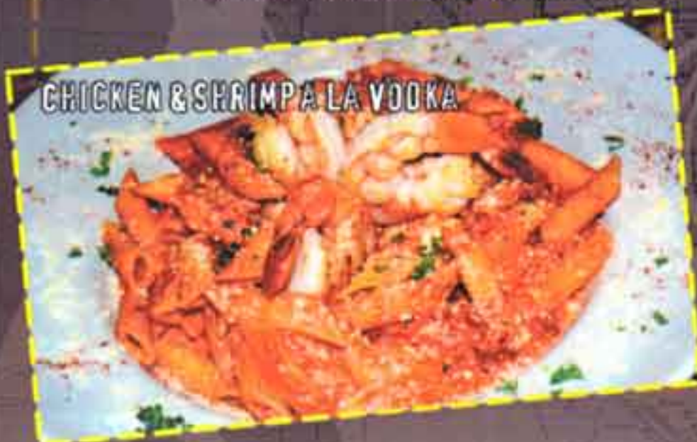
CHICKEN & SHRIMP A LA VODKA

Spaghetti with marinara sauce and Parmesan cheese delicious! 10.99