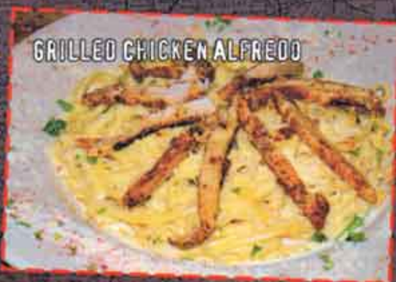
GRILLED CHICKEN ALFREDO

Penne pasta tossed in our own creamy Vodka sauce with chicken and shrimp. 16.99