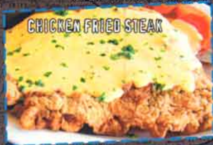
CHICKEN FRIED STEAK

All Entrees Below Come With Soup Or Salad, Potato Or Veggie Of The Day.